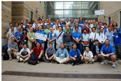
First PostgreSQL Conference, 2006