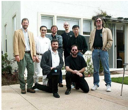
PostgreSQL Core Team, 2000