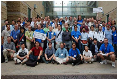
First PostgreSQL Conference, 2006