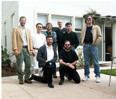
PostgreSQL Core Team, 2000